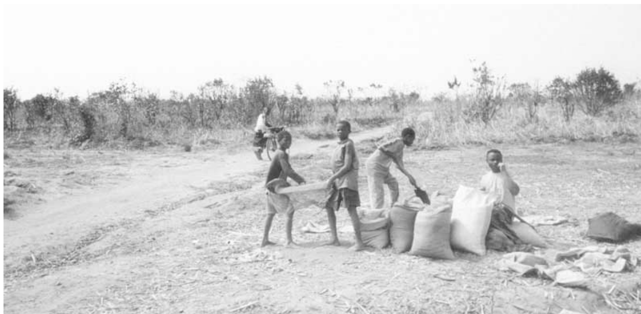
Young boys sieving heterogenite, Kolwezi, DRC, May 2004.

A similar situation can be seen in Lubumbashi, where people have complained about a large factory located in the heart of the city, and fear that radioactive materials from Shinkolobwe are being treated there 97 . In addition to high pollution and dust levels in these towns, the local population have expressed serious concern about water pollution in the region. A factory processing minerals has been installed on the Kipushi Road, on a site where the local water company are treating the water used by around 70% of the population of Lubumbashi. People fear their drinking water is becoming contaminated. 98 Local NGOs have complained to the government about this issue, but no action has yet been taken to address the situation.