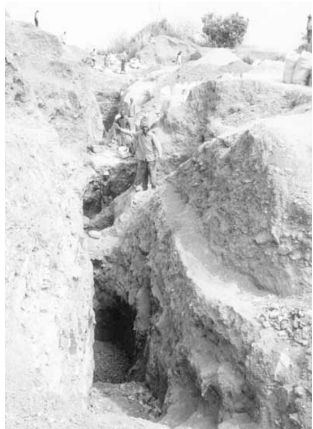
Artisanal mine, Kolwezi, DRC, May 2004.

After the secession movement was quelled, mining in Katanga resumed providing the central government with a major source of revenue. In 1966