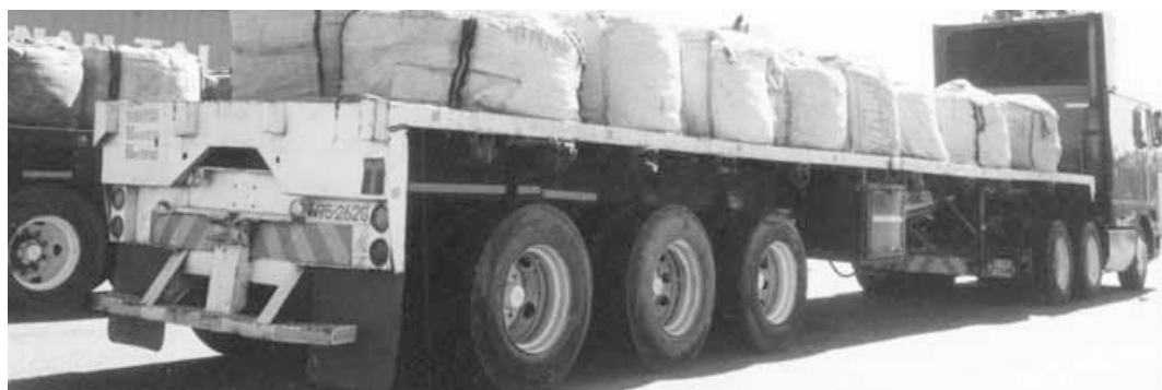
Truck in Johannesburg loaded with heterogenite from the DRC, May 2004.

Table 2 (below) illustrates the rising trend and high levels of China's imports of cobalt ores and concentrates from the DRC. In 2003 China imported almost 39,000 tonnes of cobalt ores from the DRC at a c.i.f. (import value) of approximately $24,118,000. 99 In the first five months of 2004 alone China has imported almost 22,000 tonnes, with a c.i.f value of over US$35,481,000. This is a stark illustration of the enormous revenues that could potentially be captured by the DRC but which are being lost due to an appalling lack of oversight of mining operations and revenue streams in the DRC.