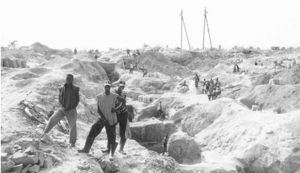
Artisanal mine, Kolwezi, DRC, May 2004.

the export of heterogenite from Katanga are not collected. While some information is filtering back to the Ministry from Alex Stewart International Corporation (the company appointed to assay (analyse) minerals exported from the DRC), this does not present a coherent picture of the quantities of minerals being exported and Alex Stewart International Corporation (ASIC) does not analyse all heterogenite being taken from the DRC. Instead, the Ministry of Mines advised Global Witness to approach the customs office for statistics or to look at import figures for China in order to get an idea of quantities leaving the DRC. 44