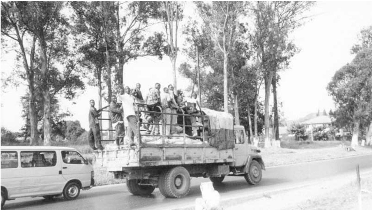
Truck transporting artisanal miners and heterogenite, Lubumbashi, DRC, May 2004.

heterogenite they receive arrives without a certificate from their partner office in Lubumbashi, and those certificates that do accompany the trucks are usually forged. 62 This indicates that companies are forging the requisite certificates themselves rather than paying ASIC for them in Lubumbashi.