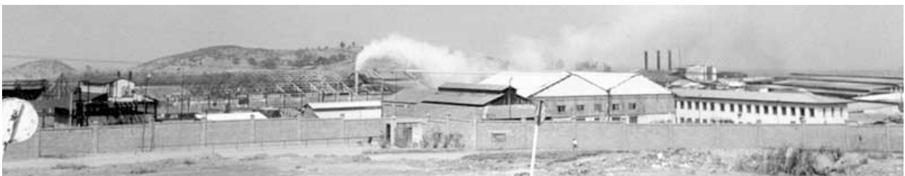
Shituru factory, Likasi, DRC, May 2004.

The result is a colossal contrast between the booming heterogenite trade and an area with a desperate population. Katanga was once the “jewel in the Congo's crown,” but has dramatically deteriorated over the past ten years. The collapse of Gécamines meant a rise in unemployment in the region, and also resulted in the closure of many schools and hospitals originally provided by the company for families of employees. Schools in the area lack funds to pay teaching staff and provide necessary equipment and the hospitals in and around Lubumbashi are now suffering from a serious supply shortage. A “brain drain” from the area has meant many of the doctors and professionals from Katanga have gone elsewhere in search of employment opportunities.