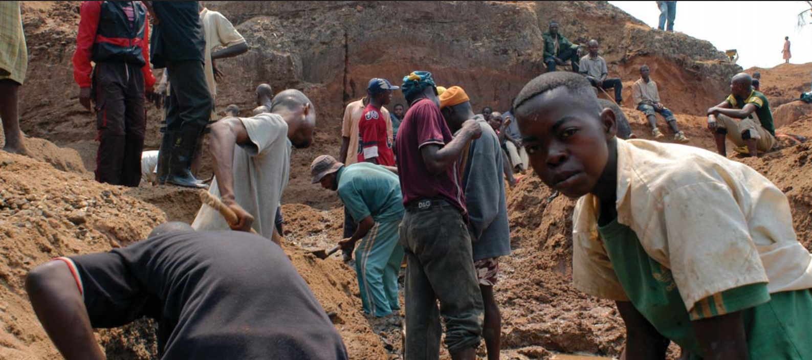
Artisanal diamond diggers in Mbuji Mayi, DRC.