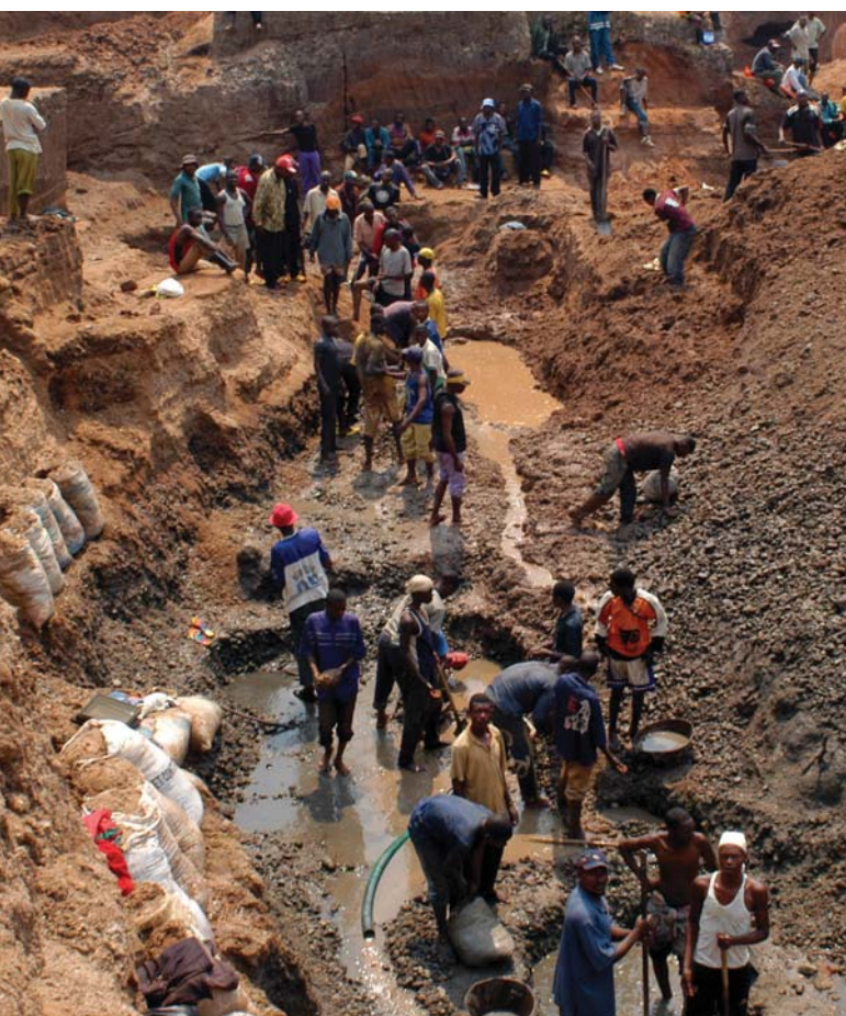
Artisanal diamond diggers in Mbuji Mayi, DRC.