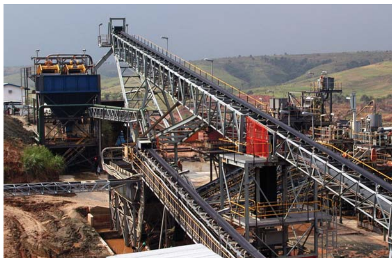
DRC's industrial diamond mining parastatal – MIBA.

A large number of diamonds are being exported through official channels, being certified before export by the Centre of Evaluation, Expertise and Certification (CEEC), the government agency responsible for the implementation of the Kimberley Process in the DRC. However, internal controls over the mining and trade in rough diamonds are poorly enforced and diamonds cannot be tracked from the mine to export: a crucial component of the Kimberley Process. There is little knowledge of where the diamonds originate from,